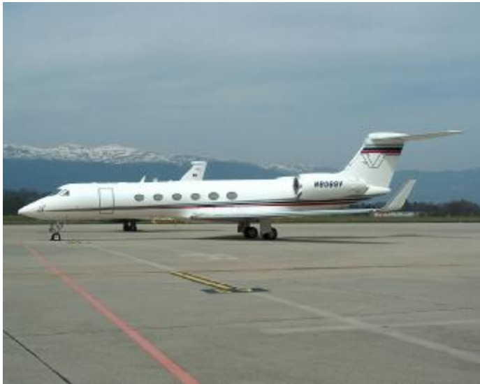
CIA operated Gulfstream V